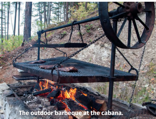
The outdoor barbeque at the cabana.

"The first time, it's a vacation. After that, it's coming home."