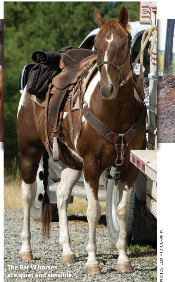
The Bar W horses are quiet and sensible.