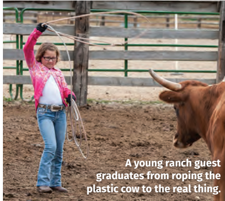
A young ranch guest graduates from roping the plastic cow to the real thing.

5947 North Green Lake Road 70 Mile House, BC 1.877.436.7717 reservations@flyingu.com