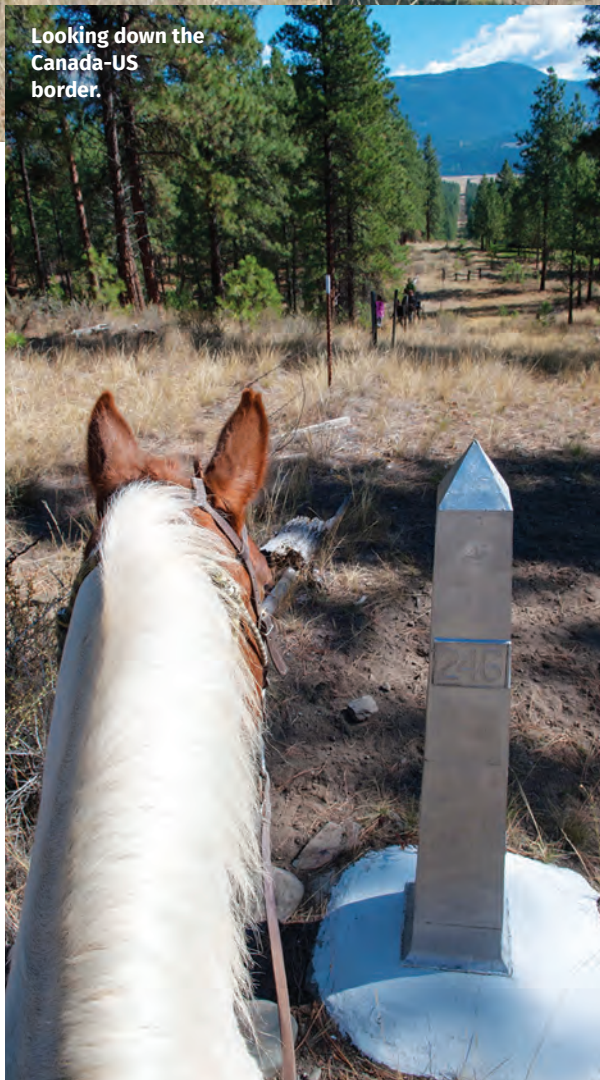
Looking down the Canada-US border.

Breakfast was served at 8 am in the main lodge, a guesthouse and dining area of classic elegance and traditional Western informality. We introduced ourselves to the other guests, including a family with two daughters, a couple from Boston enjoying their third visit, and another couple from California hunting for their perfect retirement property. The breakfast of sausage, biscuits, and gravy was quickly devoured before gearing up and heading out to meet the horses for our orientation ride.